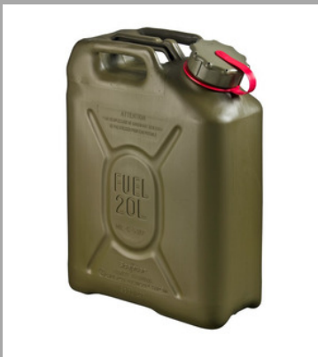
20-LITER Military Olive Drab P/N 05552 UN# 2-456

Used by NATO, the USA and Canadian military, these cans are Scepter's premium.