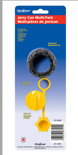
MULTI PACK P/N 03583