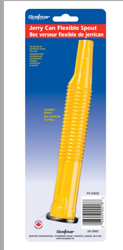
SPOUT P/N 03629