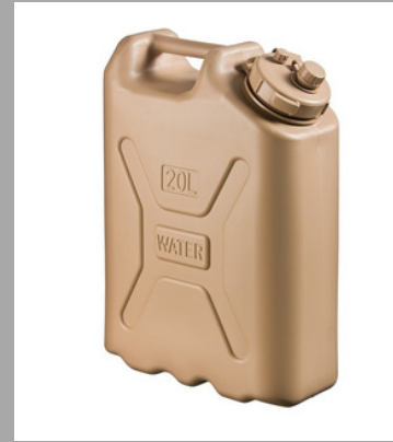
20-LITER Sand WATER CAN P/N 05935