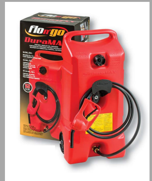
DURAMAX COMBO 53L Combo P/N 06792 UN# 2-2546

The DuraMax Flo'N Go is a large 53 Liter, portable fuel container on wheels designed for farm, commercial, industrial, and recreational applications. The DuraMax fuel container is resistant to corrosion and denting, and can stand vertically or lay horizontally. It's sturdy six-inch wheels and extra-deep handle make it easy to deliver to any location.