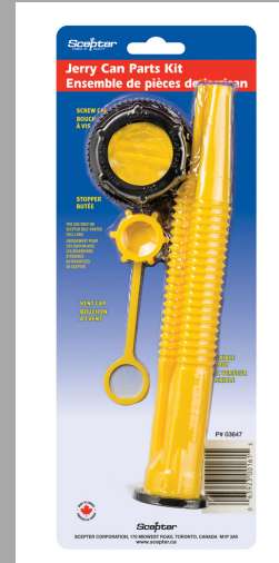
PARTS KIT P/N 03647