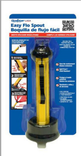
EASY FLO P/N 00072