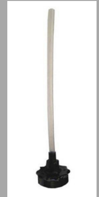
SPOUT Military Spout P/N 04856