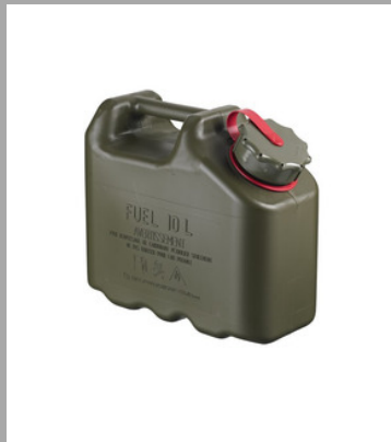
10-LITER Military Olive Drab P/N 05895 UN# 2-2265